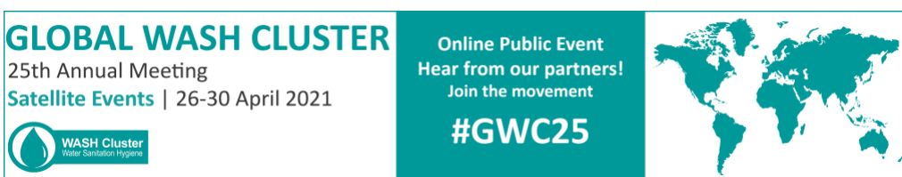
Fig.1 – GWC Partners Attendance at the #GWC25

Following the GWC's Annual Meeting, the GWC Satellite Events were hosted virtually and online from 26 th – 30 th April 2021. This was a first-of-its-kind event and included 18 participatory and collaborative sessions hosted by a wide range of partners representing the humanitarian WASH sector and beyond. The sessions covered a diverse array of topics, including localisation, GBV and gender, cash and markets, accountability and quality assurance, capacity building and learning, and operational research related to humanitarian coordination in the WASH sector.